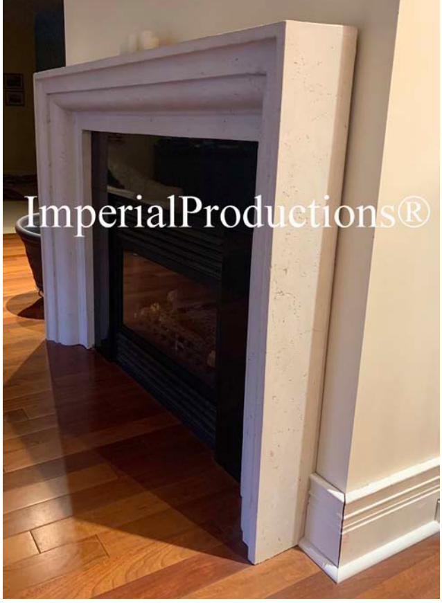
1 Piece Mantel Easy Install

Mantel Top 65" (165cm) Mantel Top Depth 7" (17.8cm) Height 46" (116.84cm)